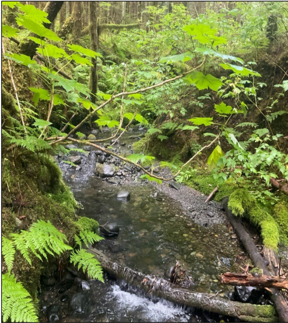
Figure 2.—Step pool at waypoint 1060, looking upstream.