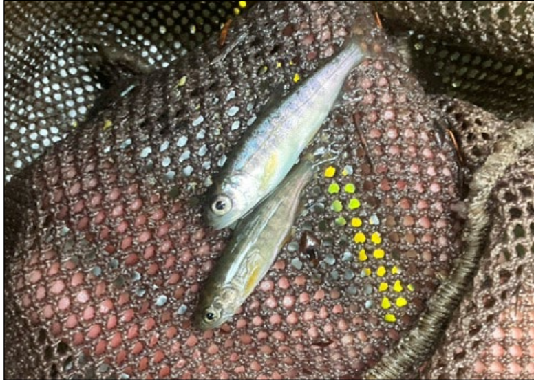
Figure 1.—Juvenile coho salmon caught at waypoint 1057.