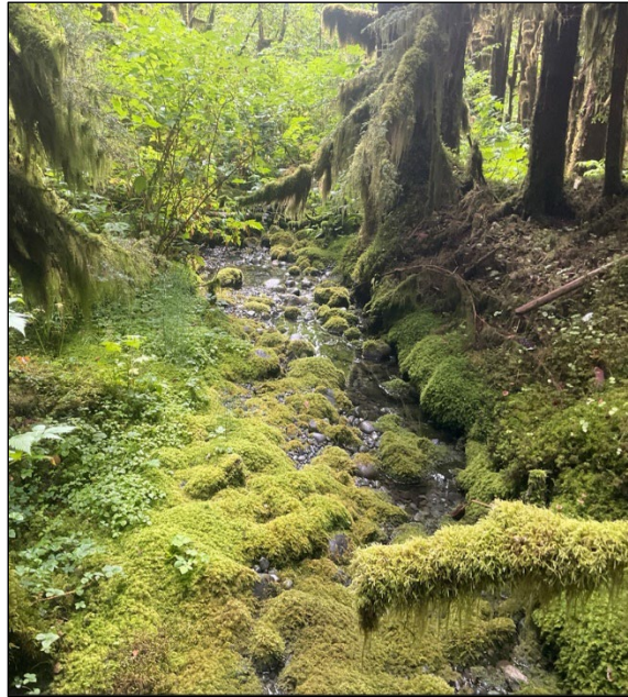
Figure 3.—Upstream at waypoint 1064.